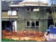
▲ Minimum disruption during construction stages