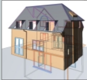
▲ Outstanding quality 3D graphics to show you precisely how your home will be transformed